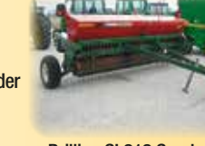
Brillion SL212 Seeder