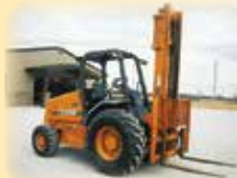
Case 586G ROPS 4WD Forklift 3767 Hrs.

2011 JD 244J C/A Wheel Loader 2593 Hrs. 1980 JD 401B D 2WD w/Loader Case 586E ROPS 2WD Forklift Case 586E 4WD Forklift Cat V60C Forklift JD 595 Backhoe Fits 5000 Series JD 960 Skid Steer Backhoe Attachment IH 3082 3pt Backhoe Attachment Long 1199A 3pt Backhoe Frontier Grapple 1999 Ford F450 V-10 5-Spd 16' Tommy Lift Bed 120,000 Miles New Lowe Hyd Auger 750 w/12" w/skid steer quick attach New MS WT Pallet Forks New Stout XHD84-6 Brush Grapple New Stout 72-8 Brush Grapple New Stout HD72-FB Grapple Bucket New Stout HD72-4 Brush Grapple New Stout HD72-3 Rock Bucket Grapple New Stout 72-3 Rock Bucket Grapple New Stout 66-9 Brush Grapple New Stout Tree & Post Puller New Stout Add-on Fork Grapple New Stout Bale Spear New Skid Steer Plates JD Skid Steer 14" Tracks Skid Steer Tracks Berton Skid Steer Salt Spreader New 12' & 10' & 8' & 7' Pull Type Box Blades Frontier BB2184 3pt Box Blade New Blue Pivot Track Closer Easyman SS Single Bale Spike Kaeser M57 Air Compressor PT 96"X40" Roller 1979 20' Pintle Hitch Trailer w/Air Brakes