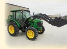
2013 5101E C/A MFD PReverse w/Westendorf Max 420 Loader 2937 Hrs.