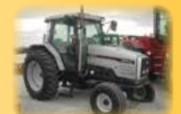
1997 White 6710 C/A 2WD 5140 Hrs. Noise in Rear End

MF 65 D Kubota LA1601S Loader MX125 Mts. Fire Damage Bushhog M546 Loader Fire Damage Gehl 95 Grinder Mixer Knight 1150 Pro Tandem Axle Manure Spreader NH 185 Tandem Manure Spreader Hertz Diesel Generator AC Diesel Generator Kewanee 1010 20' Disc Krause 1404 21' Disc Wilbeck 12' Offset Disc Anderson 5' Rock Picker MF 129 12' 13-Shank 3pt Chisel Better Built 2300 Liquid Manure Tank Kelly Ryan 8X4 Feed Wagon Grain-O-Vator Auger Wagon IHC 950 Grinder Mixer Alamo 15' Rotary Cutter AC 3pt 5-BTM Semi Plow AC 3pt 3-BTM Plow CaseIH 1064 6-Row Wide Cornhead 2 - New 11.2X24 Tires 2 - New 15.5X38 Tires 2 - New 16.9X38 Tires 4 - New 16" Tires & Rims 10ply Dually 4 - New 7.00X15 8ply Tires 4 - New 235X80R X 16 Tires 10ply