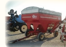
Ez Trail 3400 Gravity Wagon w/Auger

Unverferth 1017 Grain Cart Unverferth 9250 Grain Cart A&L 456 Grain Cart Brent 1084 Grain Cart Brent 678 Grain Cart Brent 572 Grain Cart Brent 420 Grain Cart Kilbros 1185 Grain Cart Kilbros 110 Grain Cart w/Tarp Kinze 400 Grain Cart UFT 565 Grain Cart J & M 375 Grain Cart Parker Grain Cart JD 724 Soil Finisher Brillion 30' X-Fold Roller NH Savage 6570 9' Aerator DMI 4250 35' AA Applicator Blue Jet AT3000 Liquid Applicator Bushnell Gravity Wagon w/Auger Killbros 350 Gravity Wagon w/Auger Killbros 350 Gravity Wagon Brent 440 Gravity Wagon Unverferth 325 Gravity Wagon (2) Gravity Flow Side Dump Wagons JD 716A Wagon w/Hoist