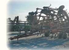
CaselH Tigermate II 200 33' w/Harrow

2013 JD 2210 24.5' w/Harrow 2008 JD 2210 25.5' w/Harrow JD 2200 24' w/Harrow JD 1000 24' Pull Type w/Harrow JD 980 34' w/Harrow JD 980 27' w/Harrow JD 980 21' w/Harrow JD 980 44' w/Harrow JD 960 22' w/Harrow (2) JD 1100's 3pt CaselH 4800 w/Harrow CaselH 4300 28' w/Harrow CaselH 4300 26.5' w/Harrow CaselH 4300 w/Harrow IHC 4600 w/Harrow Wilrich 24' Wilrich 2800 20' Sunflower 5652 Kent 5323 25' Landoll Wilrich 22' JD 825 12-Row JD 825 8-Row 3pt CaselH 183 4-Row 3PT Krause 4600 6-Row 3PT