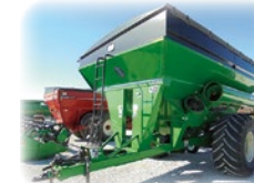
2016 Brent 1082 Grain Cart w/Scales