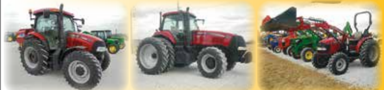
2013 CaseIH Maxxum 120 C/A MFD Powershift 1300 Hrs. 2008 CaseIH Magnum 215 C/A MFD Powershift w/Duals 2650 Hrs. 2013 CaseIH 50B Rollbar MFD w/CIH L350 Loader 87 Hrs.

2011 CaseIH Maxxum 140 C/A MFD Powershift w/CIH L750 Loader 2116 Hrs. 2010 CaseIH Maxxum 125 C/A MFD Powershift w/CIH 760 Loader 3584 Hrs. 2003 CaseIH MX230 C/A MFD Powershift w/Duals 2533 Hrs. 2003 CaseIH MXM175 C/A MFD Powershift w/Duals 5300 Hrs. 1989 CaseIH 7120 C/A MFD Powershift w/Duals CaseIH 2294 C/A MFD 7040 Hrs. 1987 Case 3394 C/A MFD Powershift w/Duals 4887 Hrs. 1974 IHC 100 2WD Hydro w/IHC 2350 Loader IHC 424 Gas 1981 IHC 1486 C/A 2WD w/Duals 1981 IHC 1086 2WD w/Canopy 1968 IHC 656 Gas Hydro W.F.