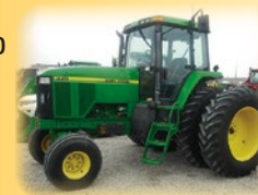
1997 7610 C/A 2WD P.Quad w/Duals 7133 Hrs.