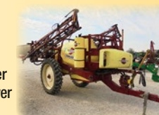
Hardi Commander Plus 750 Gallon Sprayer

Wiegand Wagon w/Hoist Grain-O-Vator Wagon Kelly Ryan Feed Wagon Henke 2210 Feed Wagon Hardi 950 900 Gallon Sprayer Schaben 3pt 300 Gallon Sprayer Malvese SS Sprayer Demster Fertilizer Spreader Farmking C6572 6' 3pt Tiller Brillion 120 10' Seeder JD 38 Chopper w/2RN Cornhead NH 717 Chopper Lely 14' Rotary Hoe Kewanee Cultimulcher Bushhog 7008 8' 3pt Blade JD Front Blade Green 10' 3pt Hyd Blade Yellow 9' 3pt Hyd Blade Green 3pt 10' Hyd Blade Blue 8' 3pt Hyd Blade Black 3pt 8' Hyd Blade Landpride 9' 3pt Blade Frontier 3pt Blade Danuser 3pt Post Driver J & M 35' Trailer EZ Trail 680 Header Trailer 35' Header Trailer Unverferth HT30 Header Trailer D & M Header Trailer Stud King 38' Header Trailer (2) Challenger HC30 Header Trailers