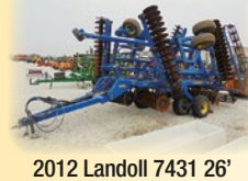
2012 Landoll 7431 26' w/Rolling Harrow

IHC 470 IHC 8' Oliver 265 Bushog 14' Pittsburg 12' MF 68 10' 3pt Ford 8' 3pt Miller Offset PK 10' Offset Krause Offset