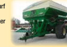
Kilbros 1185 Grain Cart