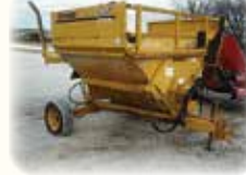
Vermeer BP5000 Bale Processor

Vermeer BP8000 Bale Processor Ag Wrap Bale Wrapper Ag Wrap Bale Handler Hoelscher 8-Bale Accumulator JD 700 Twin Rake (2) Vermeer R23 Twin Rakes 2011 NH H6830 Disc Mower 2009 Vermeer M6040 7' 3pt Disc Mower Vicon AM2800 Disc Mower Vicon KM4000 Disc Mower MF 1330 Disc Mower 2016 NH H7320 Discbine 2014 CaseIH DC133 Discbine JD 936 Discbine CaseIH 8340 Haybine JD 1209 Haybine NH 1431 MoCo JD 1327 Flail MoCo 2008 JD 946 Flail MoCo JD 945 Flail MoCo JD 630 MoCo NH 415 MoCo NH 499 Haybine NH 450 7' Sickle Mower