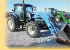
2003 NH TS115A C/A MFD Powershift w/NH 56LB Loader