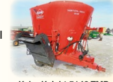
Kuhn Knight 5143 TMR Vertical w/Scales

Kuhn Knight 3130 TMR Horizontal w/Scales Schuler MS550 TMR Vertical NH 353 Grinder Farmhand Tub Grinder JD 700 Grinder w/Hay Table Gehl 55 Grinder Artsway 325A Grinder