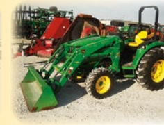
2015 4052R Rollbar MFD P.Reverse w/JD H180 Loader 1118 Hrs. Warranty