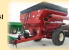
Brent 572 Grain Cart

Frontier 1067 3pt Seed Spreader Ag Chem 554 Rogator 650 Gal 80' Boom Sprayer 4000 Hrs. Clay MT1500 Honey Wagon New Blue Wagon Feeder Bushhog Box Wagon w/Hoist Gehl 1000 2RN Chopper Gehl 860 2RN Chopper JD 950 15' Cultimulcher Kewanee 15' Cultimulcher Brillion PT 14' Cultimulcher Brillion 12' PT Cultimulcher Yeager Twose Y-TC10 3pt Turf Conditioner Kilbros Gravity Wagon w/Auger Parker Gravity Wagon JD 3800 Chopper w/2RW Cornhead Phoenix 50' Harrow 15' Harrowgator McFarlane Rolling Harrow 3pt Pasture Harrow 6' Chain Drag 3pt (new) Egedal 6' PT Fertilizer Spreader JD 400 20' 3pt Rotary Hoe Hardi TR500 PT Sprayer M&W Gravity Box New Concrete 8x2.5 Feed Bunks Rhino 10' 3pt Hyd Blade JD 534 9' Blade Frontier RB2296 Blade Frontier 1084 3pt 7' Blade JD 7' 3pt. Blade Emco 8' 3pt Blade Danuser 3pt Post Driver Federal Auger Hopper New Black 435 & 430 Header Trailer EZ Trail 680 Header Trailer 35' Header Trailer Move Master 25' Header Trailer 20' Header Trailer Unverferth 25' Header Trailer Econline Flatbed Trailer ExMark Lazer 72" Zero Turn Mower Landpride 4410 4WD UTV 1016 Hrs. 2013 JD XUV550 4WD Gator 391 Hrs.