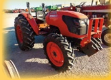
2011 Kubota M5640SU Rollbar MFD 2498 Hrs.

2005 5325 C/A MFD PReverse 3040 Hrs. 2005 5105 Rollbar 2WD JD 4020 D w/Loader CaselH 2294 C/A MFD 7040 Hrs. NH TD95D C/A MFD w/Loader 2000 Hrs. AC 7040 C/A 2WD AC 7020 C/A 2WD NH L185 Skid Steer 4557 Hrs. 1996 Bobcat 773 ROPS Skid Steer 2914 Hrs. Hdra-Mac 9C III D Skid steer IH 3082 3pt Backhoe Attachment Eversman 16' Land Leveler 3pt Dirt Scoop CaselH 3900 22' Disc White 273 28' Disc JD 235 21' Disc 1990 CaselH 496 25.5' Disc IHC 10' Pull Type Disc Sunflower Offset Disc McFarlane 30' Rolling Harrow New 6' 3pt Chain Drag Harrow Farmhand XL940 Loader IHC 2350 Loader Big Dipper Loader MF 15 Grinder Mixer JD 500 Grain Cart DMI 300 Gravity Wagon