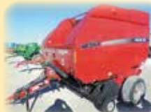
2008 CaseIH RB564 Net Wrap Baler

2014 JD 469 Net Wrap Baler 10214 Bales 2013 JD 569 Net Wrap Baler 2012 JD 568 Net Wrap Baler 2006 JD 567 Net Wrap Baler JD 535 Net Wrap Baler JD 348 Square Baler JD 336 Square Baler CaseIH 8465A Baler NH 326 Square Baler NH 570 Square Baler Hesston 3717 4-Basket Tedder