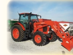
2014 Kubota M135GX C/A MFD w/ Kubota LA2254 Loader 2484 Hrs.