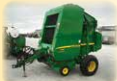
JD 469 Net Wrap Baler 4056 Bales.

2014 JD 469 Net Wrap Baler 10214 Bales 2013 JD 569 Net Wrap Baler 2012 JD 568 Net Wrap Baler 2006 JD 567 Net Wrap Baler JD 535 Net Wrap Baler JD 348 Square Baler JD 336 Square Baler CaseIH 8465A Baler NH 326 Square Baler NH 570 Square Baler Hesston 3717 4-Basket Tedder