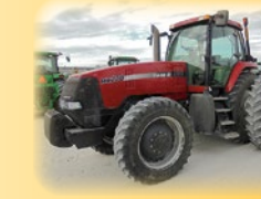
2003 Case IH MX230 C/A MFD Powershift w/Duals 2533 Hrs.