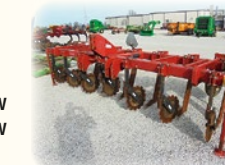
Sunflower 4317 7-Shank 15' In-Line Ripper

DMI Disc Ripper JD 1710 Chisel JD 1600 14-Shank Chisel JD 915 9-Shank Ripper JD 910 7-Shank Ripper Pull Type JD 910 7-Shank Ripper Kewanee PT Chisel JD 6-BTM P.T. Plow JD 2700 5-BTM Plow JD 3-BTM 3pt Plow Ford 419 3-BTM 3pt Plow Ford 338 2-BTM 3pt Plow Ford 3-BTM 3pt Plow IHC 3-BTM 3pt Plow IHC 710 3-BTM Plow IHC 4-BTM 3pt Plow