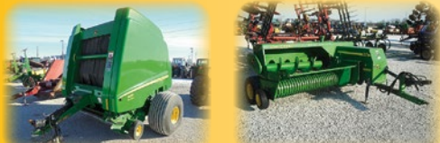
2013 JD 569 Premium Net Wrap Baler 5138 Bales