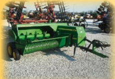
JD 348 Square Baler w/Thrower

JD 348 Wire Square Baler JD 854 Silage Net Wrap Baler (2) JD 535 Balers NH BR7090 Net Wrap Baler 200 Bales NH 575 Baler NH 570 Square Baler NH 346 Wire Square Baler Vermeer 505M Net Wrap Baler 2000 Bales Vermeer 5410 Rebel Baler Vermeer 605XL Net Wrap Vermeer 605L Net Wrap Baler Hesston 5556A Round Baler Hesston 540 Baler Vermeer BP8000 Bale Processor Vermeer BP5000 Bale Processor Farmhand Bale Accumulator Hoelscher 100 Hyd Bale Grapple JD 702 10-Wheel Rake Kuhn SR108 Rake Sitrex MK 12-Wheel Rake Vicon 3pt 8-Wheel Rake (2) Vermeer R23 Twin Rakes JD 350 Rake