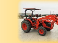
2013 Kubota MX5100 Rollbar MFD HST w/Kubota LA844 Loader 44 Hrs.