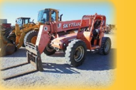
2007 JLG Skytrak 6042 4X4 Telehandler 3801 Hrs.