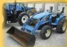
NH TC35A Rollbar MFD w/Ldr.

MF 65 D Kubota LA1601S Loader MX125 Mts. Fire Damage Bushhog M546 Loader Fire Damage Gehl 95 Grinder Mixer Knight 1150 Pro Tandem Axle Manure Spreader NH 185 Tandem Manure Spreader Hertz Diesel Generator AC Diesel Generator Kewanee 1010 20' Disc Krause 1404 21' Disc Wilbeck 12' Offset Disc Anderson 5' Rock Picker MF 129 12' 13-Shank 3pt Chisel Better Built 2300 Liquid Manure Tank Kelly Ryan 8X4 Feed Wagon Grain-O-Vator Auger Wagon IHC 950 Grinder Mixer Alamo 15' Rotary Cutter AC 3pt 5-BTM Semi Plow AC 3pt 3-BTM Plow CaseIH 1064 6-Row Wide Cornhead 2 - New 11.2X24 Tires 2 - New 15.5X38 Tires 2 - New 16.9X38 Tires 4 - New 16" Tires & Rims 10ply Dually 4 - New 7.00X15 8ply Tires 4 - New 235X80R X 16 Tires 10ply