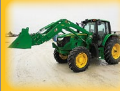
2015 6140M C/A MFD 24-Spd P.Quad w/JD H360 Loader 837 Hrs.