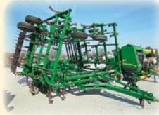
2013 JD 2210L 40.5' w/Harrow