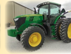
2012 6170R C/A MFD 20-24-Spd P.Quad w/Duals 746 Hrs.