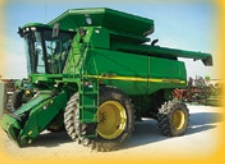
2001 JD 9750 STS 4WD CM Combine 2421/3525 Hrs.

JD 7720 2WD Combine JD 6620 2WD Combine 3600 Hrs. 2010 JD 635F CM Flex Head 1999 JD 925F Flex Head 1996 JD 925LL 25' Rigid Head JD 925F Flex Head JD 925F CM Flex Head JD 920 Head JD 920 Flex Head JD 918 Head 2004 JD 630F CM Flex Head JD 630 Head JD 213 Rigid JD 212 5-Belt Pick Up Head JD 100 5-Belt Pick Up Head CaselH 1020 25' Head CaselH 1020 Flex Head 2016 JD 608C CM Cornhead JD 608C Cornhead JD 693 CM Cornhead JD 643 Cornhead CaselH 1083 Poly Cornhead