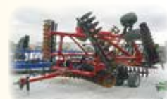
2016 CaseIH 345 28' w/Harrow

JD 630 24' JD 630 22.5' JD 235 21' JD BWF JD AW 9' PT JD RWA 12' PT 2016 CaseIH 345 28' w/Harrow 2012 Landoll 7431VT 26' w/Rolling Basket 2012 CaseIH 340 22.5' w/Rolling Basket CaseIH 3900 22.5 7" Spacing 1990 CaseIH 496 25.5' CaseIH 496 22.5' w/Harrow Case 20' IHC 480 IHC 475 18' Hyd Fold IHC 470 IHC 330 Wheel IHC 8' Wheel Krause 21' Krause 3951N 20' Krause 12' Krause 9' AC 14' Encoe 6' 3pt Wilbeck 11' Offset Bushhog 146 12' Offset