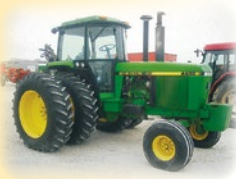
1989 4455 C/A 2WD Powershift w/Duals 5257 Hrs.