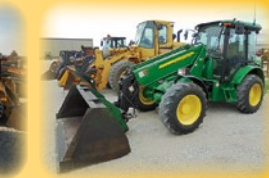
2003 JD 3800 C/A 4WD Telehandler