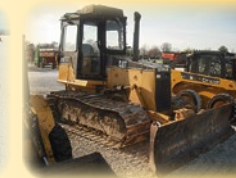
Caterpillar D3C C/A LGP Dozer