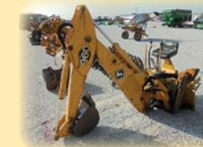
JD 960 Skid Steer Backhoe Attachment

2005 5325 C/A MFD PReverse 3040 Hrs. 2005 5105 Rollbar 2WD JD 4020 D w/Loader CaselH 2294 C/A MFD 7040 Hrs. NH TD95D C/A MFD w/Loader 2000 Hrs. AC 7040 C/A 2WD AC 7020 C/A 2WD NH L185 Skid Steer 4557 Hrs. 1996 Bobcat 773 ROPS Skid Steer 2914 Hrs. Hdra-Mac 9C III D Skid steer IH 3082 3pt Backhoe Attachment Eversman 16' Land Leveler 3pt Dirt Scoop CaselH 3900 22' Disc White 273 28' Disc JD 235 21' Disc 1990 CaselH 496 25.5' Disc IHC 10' Pull Type Disc Sunflower Offset Disc McFarlane 30' Rolling Harrow New 6' 3pt Chain Drag Harrow Farmhand XL940 Loader IHC 2350 Loader Big Dipper Loader MF 15 Grinder Mixer JD 500 Grain Cart DMI 300 Gravity Wagon