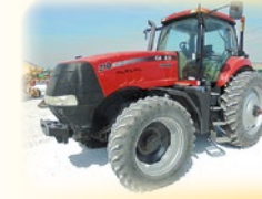
2012 Case IH Magnum 210 C/A MFD Powershift 2837 Hrs.