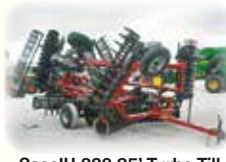
CaseIH 330 25' Turbo Till