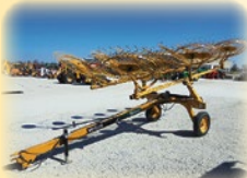
Vermeer VR1224 12-Wheel Rake Pull Type