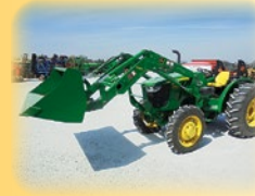
2016 5075E Rollbar MFD w/ JD H240 Loader 302 Hrs. Warranty