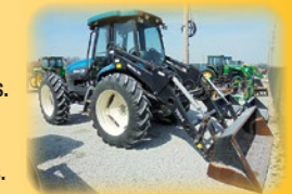
NH TV140 C/A MFD Bi Directional w/NH 7614 Loader 4149 Hrs.