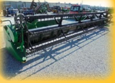
2002 JD 925 Flex Head