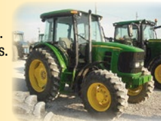
2009 JD 6140D C/A MFD P.Reverse 2348 Hrs.