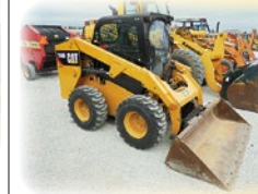
2015 Cat 246D C/A 2-Spd Skid Steer 390 Hrs.