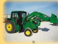
2014 6115M C/A 2WD P.Quad w/JD H340 Loader 490 Hrs.