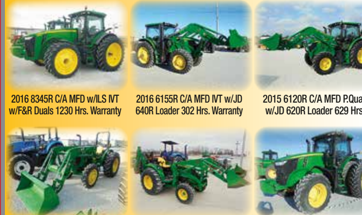
2016 8345R C/A MFD w/ILS IVT w/F&R Duals 1230 Hrs. Warranty 2016 6155R C/A MFD IVT w/JD 640R Loader 302 Hrs. Warranty 2015 6120R C/A MFD P.Quad w/JD 620R Loader 629 Hrs.