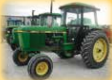
1980 4040 C/A PowerShift