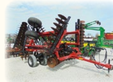
CaselH RMX340 22.5'

IHC 470 IHC 8' Oliver 265 Bushog 14' Pittsburg 12' MF 68 10' 3pt Ford 8' 3pt Miller Offset PK 10' Offset Krause Offset