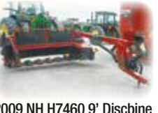
2009 NH H7460 9' Discbine