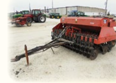
UFT 5000 10' No Till Drill w/ Grass Seeder Pull Type

2011 JD 1790 16/32 No-Till Planter JD 1770NT 16-Row Planter JD 7200 6-Row Planter w/ Liquid Fertilizer JD 7000 4-Row Planter 2007 Kinze 3600 16/31 No-Till Planter Kinze 2000 4/7 Wide Row No-Till Planter Case 900 4-Row Planter JD 1560 15' No-Till Drill JD 750 No-Till JD 450 Drill JD 8300 Drill IHC 20' Drill w/Caddy Great Plains 2020 3pt 20' Great Plains 24' Drill Great Plains 24' No-Till Drill Great Plains 15' Drill w/Caddy