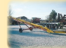
Westfield 1535FL Conveyor

Wiegand Wagon w/Hoist Grain-O-Vator Wagon Kelly Ryan Feed Wagon Henke 2210 Feed Wagon Hardi 950 900 Gallon Sprayer Schaben 3pt 300 Gallon Sprayer Malvese SS Sprayer Demster Fertilizer Spreader Farmking C6572 6' 3pt Tiller Brillion 120 10' Seeder JD 38 Chopper w/2RN Cornhead NH 717 Chopper Lely 14' Rotary Hoe Kewanee Cultimulcher Bushhog 7008 8' 3pt Blade JD Front Blade Green 10' 3pt Hyd Blade Yellow 9' 3pt Hyd Blade Green 3pt 10' Hyd Blade Blue 8' 3pt Hyd Blade Black 3pt 8' Hyd Blade Landpride 9' 3pt Blade Frontier 3pt Blade Danuser 3pt Post Driver J & M 35' Trailer EZ Trail 680 Header Trailer 35' Header Trailer Unverferth HT30 Header Trailer D & M Header Trailer Stud King 38' Header Trailer (2) Challenger HC30 Header Trailers