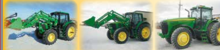
2012 6430 Premium C/A MFD 24-Spd w/JD 673 Loader 1100 Hrs. 2006 7520 C/A MFD P.Quad w/JD 741 Loader 2000 Hrs. 2003 8120 C/A MFD Powershift w/Duals 2534 Hrs.

2014 NH T6.155 C/A MFD w/NH 845TL Loader 676 Hrs. One Owner 2006 NH TG210 C/A MFD Powershift w/Duals 2668 Hrs. NH TD95D C/A MFD w/Loader 2000 Hrs. 2003 NH TS115A C/A MFD Powershift w/NH 56LB Loader 2003 NH TM130 C/A MFD w/NH 62LB Loader 7136 Hrs. 2015 NH TS6.120 Rollbar MFD 801 Hrs. 1999 NH TN55 Rollbar MFD w/NH 32LA Loader 818 Hrs. 1996 NH 7740 C/A 2WD 3944 Hrs. 1991 Ford 6610 C/A 2WD w/Ford 7210 Loader Ford 7840SL Rollbar w/Canopy 2WD 1990 Ford 8730 C/A 2WD Powershift w/Duals 6849 Hrs. 1985 Ford TW35 C/A MFD w/Loader 1988 Ford TW25 Series II C/A MFD w/Duals. 4783 Hrs. Ford 5610 Rollbar 2WD 1400 Hrs. 1976 Ford 7600 D Rollbar 2WD w/Bushhog 2846 Loader