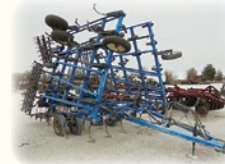
DMI Tigermate II 30' w/Harrow

2013 JD 2210 24.5' w/Harrow 2008 JD 2210 25.5' w/Harrow JD 2200 24' w/Harrow JD 1000 24' Pull Type w/Harrow JD 980 34' w/Harrow JD 980 27' w/Harrow JD 980 21' w/Harrow JD 980 44' w/Harrow JD 960 22' w/Harrow (2) JD 1100's 3pt CaselH 4800 w/Harrow CaselH 4300 28' w/Harrow CaselH 4300 26.5' w/Harrow CaselH 4300 w/Harrow IHC 4600 w/Harrow Wilrich 24' Wilrich 2800 20' Sunflower 5652 Kent 5323 25' Landoll Wilrich 22' JD 825 12-Row JD 825 8-Row 3pt CaselH 183 4-Row 3PT Krause 4600 6-Row 3PT