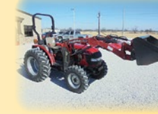
2013 CaselH 50B Rollbar MFD w/CIH L350 Loader 87 Hrs.