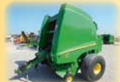
2014 JD 569 Premium Net Wrap Baler 4688 Bales