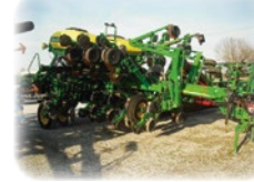
2009 JD 1790 12/23 No-Till Planter