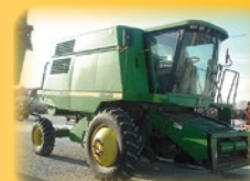
1989 JD 9500 Combine 3249/4790 Hrs.