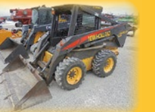
NH LS180B Skid Steer 1863 Hrs.

JD 7000 6-Row Planter White 6182 12-Row Planter JD 750 15' Drill JD 8300 Drill IHC 5100 Drill Ford 3pt 2-Row Planter NH 648 Net Wrap Baler Vermeer 605J Baler Gehl 1850 Baler Gehl 1000 2RN Chopper Gehl 860 2RN Chopper Farmhand Accumulator Farmhand Bale Claw Bushhog 2615 15' Rotary Cutter Saturn VII 7' PT Rotary Cutter Ford Sickle Mower AC 3pt 12-Shank Chisel Century PT 500 Gallon Sprayer JD 10' Front Blade JD 2pt 8' Blade Running Gear JD 3pt 5' Aerator (2) IHC 18' Markers 16' Markers Hesston Stack Mover 3pt Ford C600 Truck Several Misc. Monitors, Quick Hitches and Misc. Parts