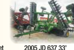
2005 JD 637 33'