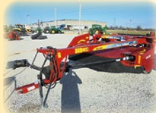
2016 NH H7320 Discbine

Hesston 12-Wheel Rake NH 258 & 260 Rakes w/Hitch 2011 NH H6830 Disc Mower CaselH DC515 Disc Mower JD 925 Disc Mower JD 275 Disc Mower Rhino PJ405H 4-Basket Tedder 2009 NH H7460 9' Discbine JD 936 Discbine CaselH 8340 Haybine CaselH 721 Swather CaselH 725 25' Swather 2008 JD 946 Flail MoCo JD 945 Flail MoCo JD 935 9' MoCo JD 925 MoCo JD 635 MoCo JD 630 MoCo JD 820 MoCo JD 1470 11' MoCo CaselH DCX91 MoCo (2) NH 499 Haybines (2) NH 489 Haybines JD 1219 Haybine (2) JD 1209 Haybines