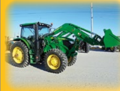
2016 6155R C/A MFD IVT w/ JD 640R Loader 302 Hrs.