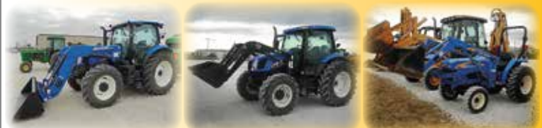
2015 NH T6.155 C/A MFD w/ NH 845TL Loader 1040 Hrs. 2003 NH TS100A C/A MFD w/ Bushhog M546 Loader 401 Hrs. 2008 NH T1510 Rollbar MFD w/NH 110TL Loader 693 Hrs.

2014 NH T6.155 C/A MFD w/NH 845TL Loader 676 Hrs. One Owner 2006 NH TG210 C/A MFD Powershift w/Duals 2668 Hrs. NH TD95D C/A MFD w/Loader 2000 Hrs. 2003 NH TS115A C/A MFD Powershift w/NH 56LB Loader 2003 NH TM130 C/A MFD w/NH 62LB Loader 7136 Hrs. 2015 NH TS6.120 Rollbar MFD 801 Hrs. 1999 NH TN55 Rollbar MFD w/NH 32LA Loader 818 Hrs. 1996 NH 7740 C/A 2WD 3944 Hrs. 1991 Ford 6610 C/A 2WD w/Ford 7210 Loader Ford 7840SL Rollbar w/Canopy 2WD 1990 Ford 8730 C/A 2WD Powershift w/Duals 6849 Hrs. 1985 Ford TW35 C/A MFD w/Loader 1988 Ford TW25 Series II C/A MFD w/Duals. 4783 Hrs. Ford 5610 Rollbar 2WD 1400 Hrs. 1976 Ford 7600 D Rollbar 2WD w/Bushhog 2846 Loader